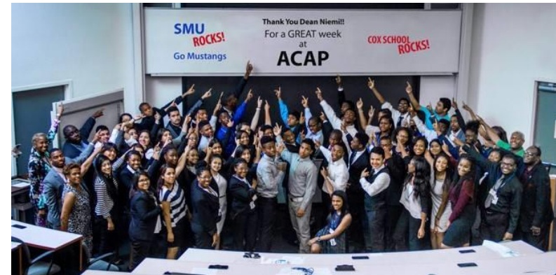
Group Picture (after Group Presentations)