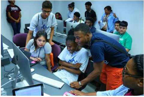
Classroom; Computer Lab; Social Outing/Alumni Night