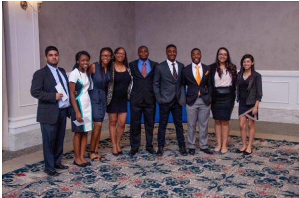
Project Group Picture (At Closing Luncheon)