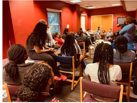
Dorm; Talk Back Session