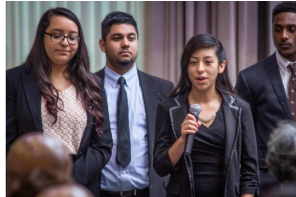
Group Presentation (At Closing Luncheon)