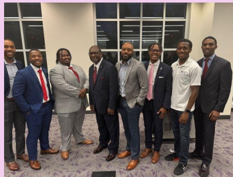
With some mentees